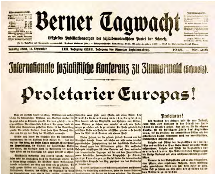
The report in the local newspaper of the Social Democratic Party